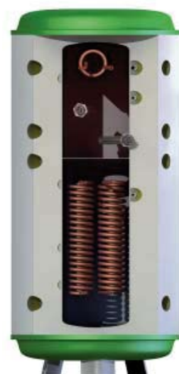
Oilon hybrid buffer tank